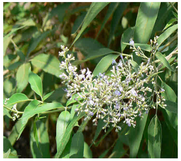
Fig 1. Image of V. negundo.

Unani drugs Turanj (dried pericarp of C. medica ) and Sangtara (dried pericarp of C. reticulata ) were purchased from Chennai Market, Tamil Nadu. The sample was dried under shade and stored at ambient temperature until use.