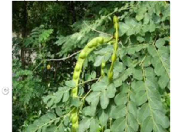
C) Adenanthera pavonina L.