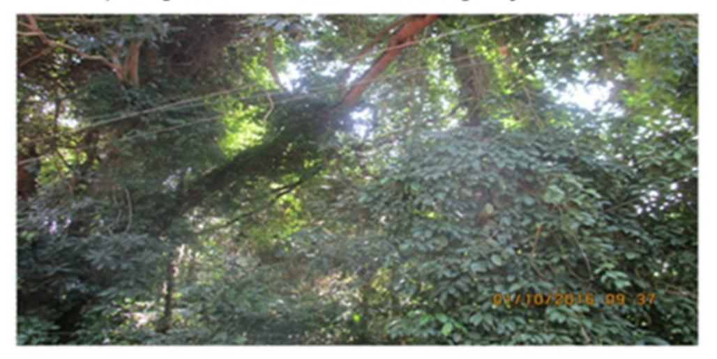
B) Image of Kanangad kavu Sacred grove