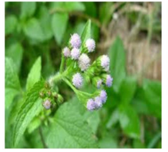
E) Ageratum conyzoides L.