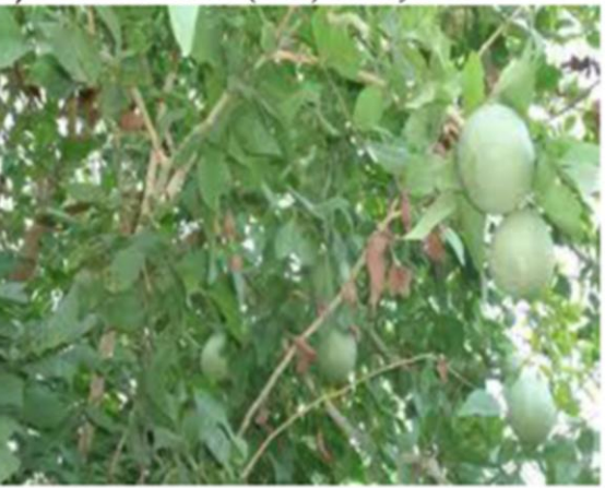
D) Aegle marmelos (L.) Correa