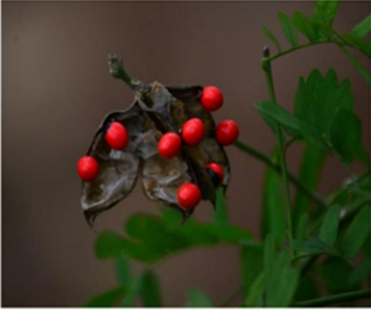
A) Abrus precatorius L.