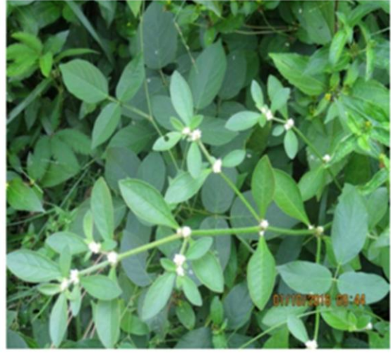
F) Alternanthera bettzickiana (Reg.) Voss.