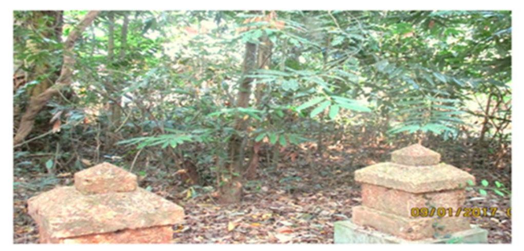
C)Image of Kavumkara Sacred grove